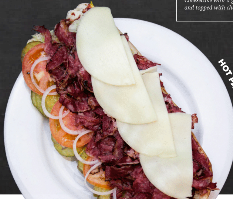
HOT PASTRAMI SUBMARINE